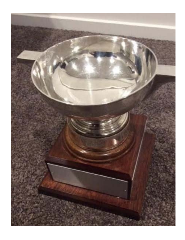
The Edinburgh Quaich Trophy