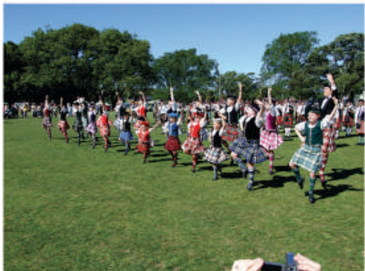
The day ended with the Massed Pipe Bands and a Highland Fling from the dancing competitors.