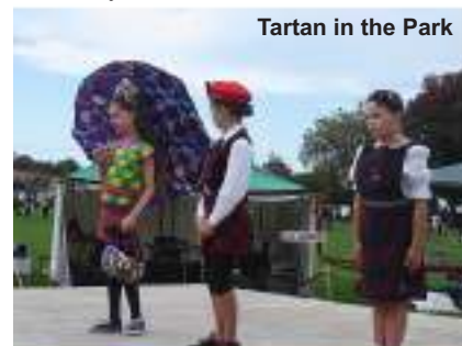
Tartan in the Park